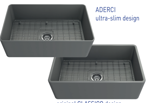
original CLASSICO design

Chic ultra-thin walls on the Aderci are half the thickness of traditional walls. Reinforced with aluminum deposits, these thinner walls are stronger than traditional models and weigh 40% less!